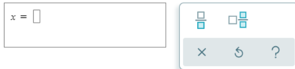
Figure 1: Screen capture of the ALEKS topic “Introduction to solving an equation with parentheses.”

Simplify your answer as much as possible.